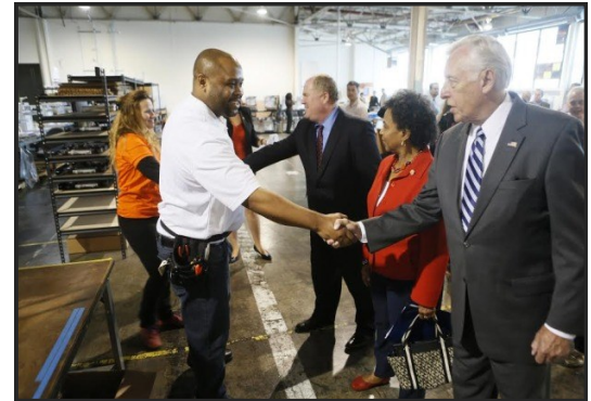
Congressmembers Barbara Lee & Steny Hoyer visit Type A Machines: “Make it in America”