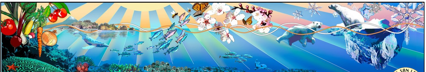
360’ x 60’ “Pulse of Nature” mural adjacent to BART at 247k sf Preferred Freezer facility